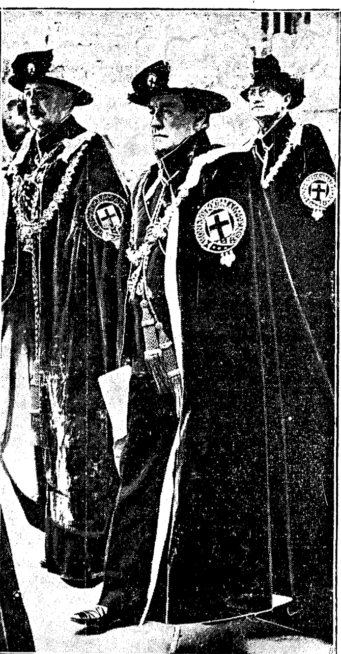
BALDWIN OF BEWDLEY—Earl Baldwin, former prime minister of England, followed by the Earl of Clarendon, walking to the Knights of the Garter service at Windsor Castle, Windsor, England